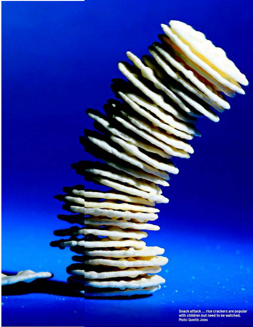
Snack attack ... rice crackers are popular with children but need to be watched.