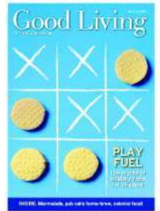
Cover: Noughts, crosses and crackers. Illustration: Dan Morley